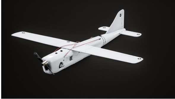
Orlan – 10 Russian Drone

power in asymmetric conflicts, allowing smaller nations to challenge larger military forces more effectively (Turchinov, 2023; Lytvynenko, 2023).