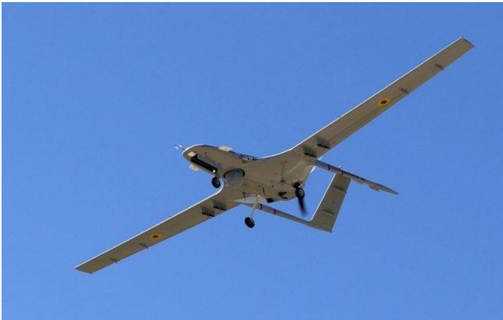
Bayraktar TB2 UAV of the Ukrainian Armed Forces

Drones have advanced significantly in terms of autonomy, payload capacity, and sensor technologies. For example, Ukraine’s use of Bayraktar TB2 drones, manufactured by Turkey, demonstrates the increasing lethality and precision of UAVs. The Bayraktar TB2 is equipped with high-resolution cameras, laser-guided munitions, and sophisticated targeting systems, making it highly effective in taking out Russian armored vehicles, tanks, and artillery positions. According to reports, Ukraine's successful use of Bayraktar drones was instrumental in delaying Russia's advance during key early phases of the conflict (Bennett, 2022; O’Hara, 2023).