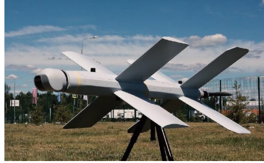
Lancet - The Russian Kamikaze Drone

A significant trend in drone technology is the integration of artificial intelligence (AI), which is poised to revolutionize military operations. Both Russian and Ukrainian forces are exploring ways to incorporate AI into their UAV systems, enabling drones to process vast amounts of data and make autonomous decisions (Duncan, 2023; Yuval, 2023). This advancement has the potential to enhance the operational efficiency of drones, allowing for quicker and more informed decision-making on the battlefield.